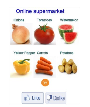
Figure 1. The product-list screen of the supermarket application, with Like and Dislike buttons

Scenario 4, for example, allows for both the checkout screen and an advertisement to be shown. Users who prefer not to see the advertisement can click the Dislike button superimposed on it. When they do so, either a new scenario is created, which traces the session's event log and then assigns show-ad a low score, or, if such a scenario already exists, the score it assigns to the undesired event is reduced. If the developer is unsure as to whether a click on a product image should lead to add-to-cart or to show-prod.-info , he/she can assign positive scores to the respective events, and allow the users to vote. Similarly, the developer can use scenarios and/or specialized APIs to analyze when, or how often, users buy an advertised product, as opposed to skipping the ad, and accordingly create scenarios that increase or decrease the score of show-ad in certain states.